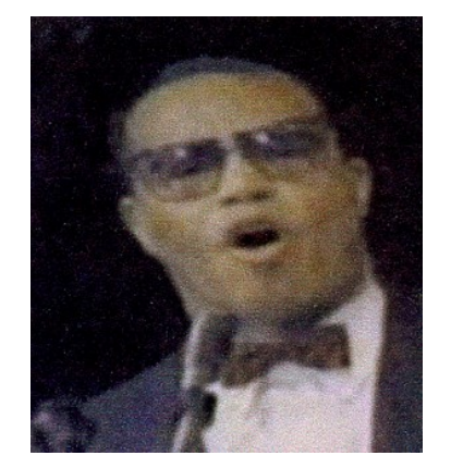
Louis Farrakhan, Minister of the NOI or Minister of "strange gods"?

<u>God is Born Incognito.</u> God was born half original (black) and half white in the holy city of Mecca on February 26, 1877. "his father," says Louis Farrakhan, "was an original Black man and His mother was a woman from the Caucasus Mountains region." (36)